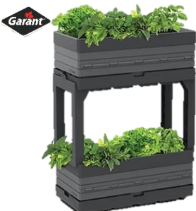
GARANT MODULAR HERB STARTER KIT GREIGE 36259750