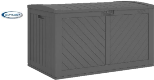
SUNCAST 134GAL DECK BOX 16985030

LUMBERYARD · RETAIL STORE · DELIVERY · PREPACK