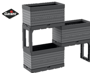
GARANT MODULAR GARDEN STARTER KIT GREIGE 36259780