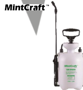
MINTCRAFT 1GAL TANK SPRAYER 36249875