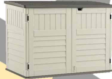
SUNCAST 70CUFT STOW-AWAY SHED 16985150