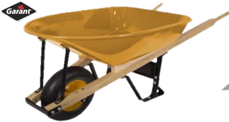
GARANT 5CUFT INDUSTRIAL FLAT-FREE WHEELBARROW 35866900